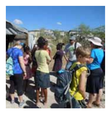
Flight participants and other team members meeting with families in Canaan.

Canaan is a place where, despite the terrible conditions, there is hope. After the tragic earthquake in January 2010 people fled the city and headed to the base of the mountain. The government eventually helped settle