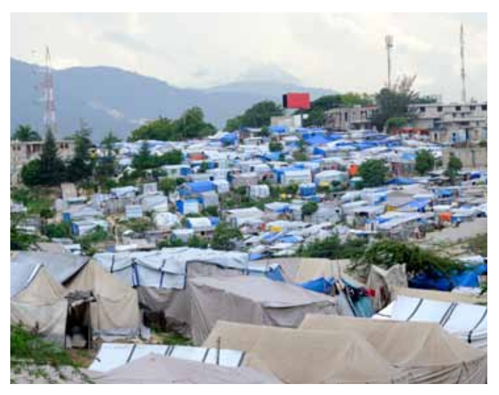
One of Haiti's tent communities that have become "home" for people displaced by the terrible 2010 earthquake.